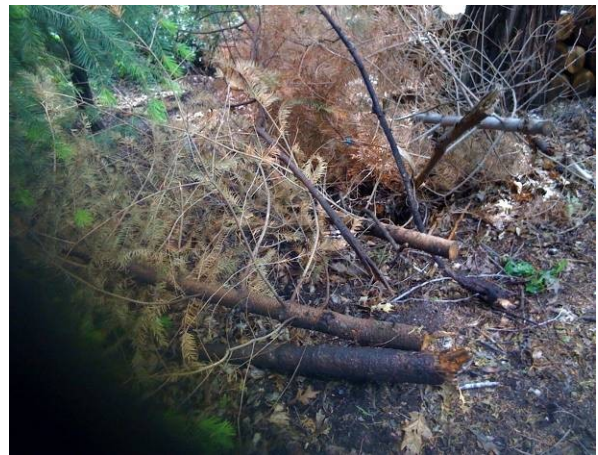
Trees properly piled for chipping crew

The NCFSC now has its own truck, chipper and crew in an effort to address this problem. A donation is suggested but the NCFSC does not want people to avoid chipping because of the cost. There are no time restrictions and the chipping crew will chip until the chipping job is completed.